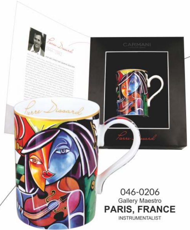
046-0206 Gallery Maestro PARIS, FRANCE INSTRUMENTALIST