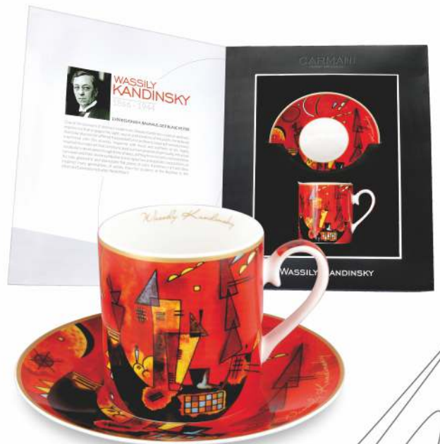
046-0303 Museum of Modern Art NEW YORK, USA WITH AND AGAINST / 1929