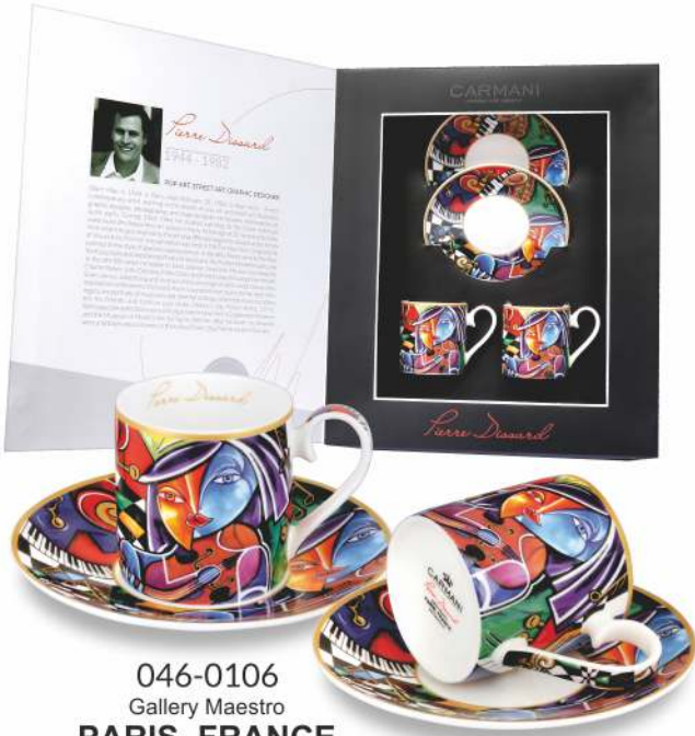
046-0106 Gallery Maestro PARIS, FRANCE INSTRUMENTALIST