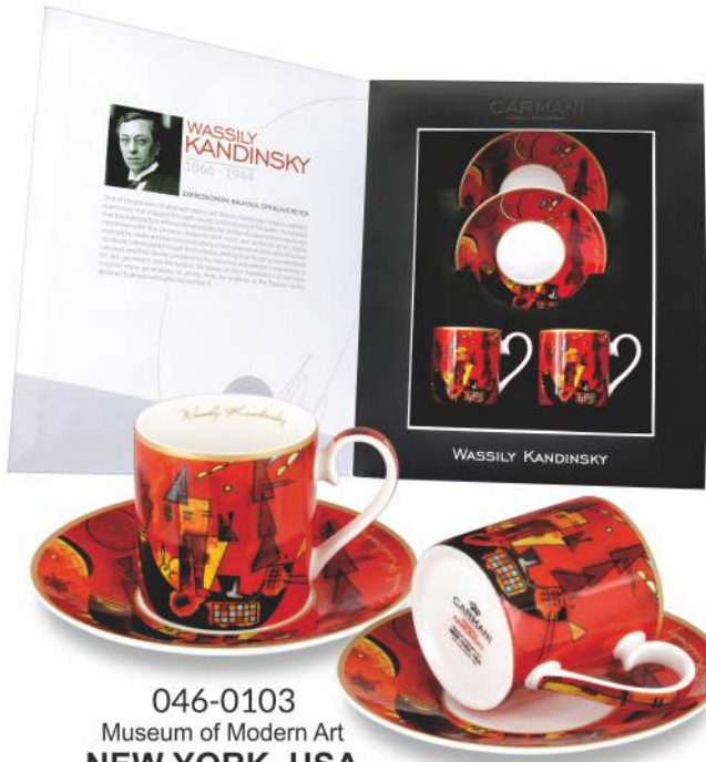
046-0103 Museum of Modern Art NEW YORK, USA WITH AND AGAINST / 1929