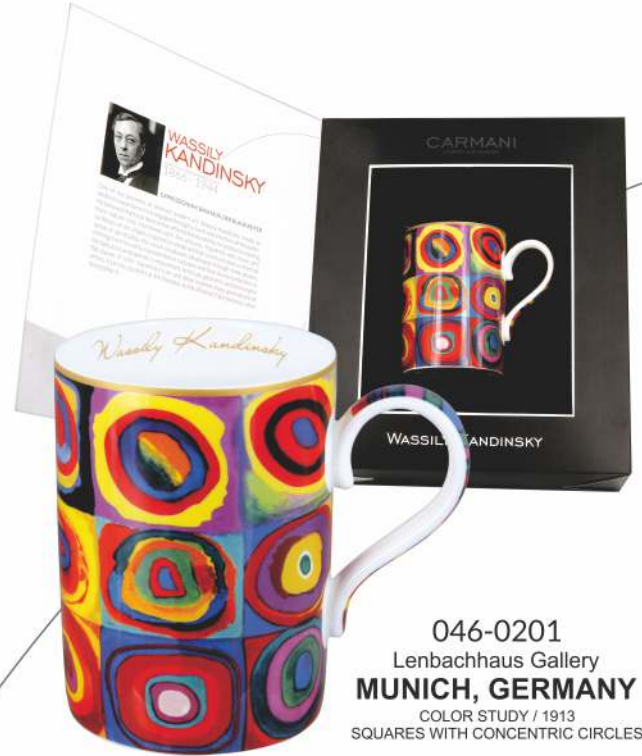
046-0201 Lenbachhaus Gallery MUNICH, GERMANY COLOR STUDY / 1913 SQUARES WITH CONCENTRIC CIRCLES