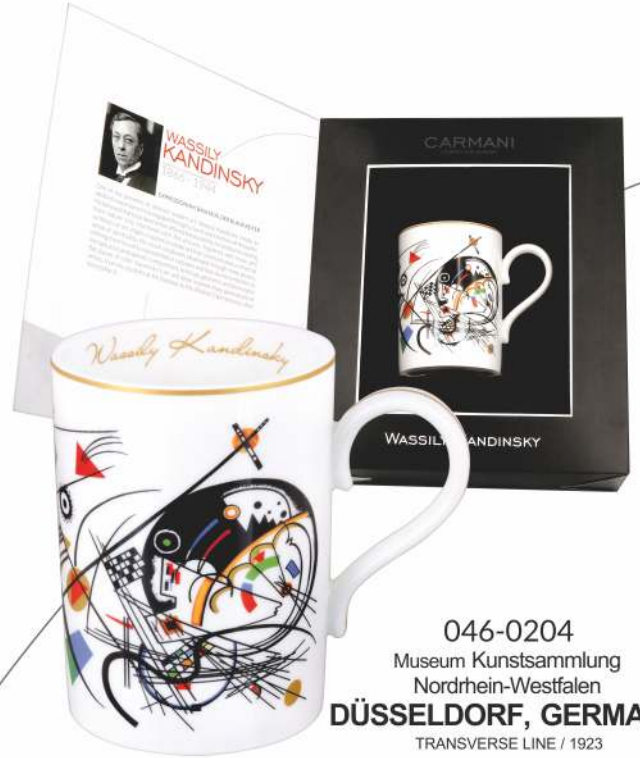
046-0204 Museum Kunstsammlung Nordrhein-Westfalen DÜSSELDORF, GERMANY TRANSVERSE LINE / 1923