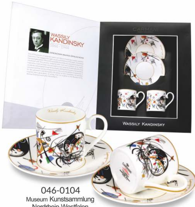
046-0104 Museum Kunstsammlung Nordrhein-Westfalen DÜSSELDORF, GERMANY TRANSVERSE LINE / 1923