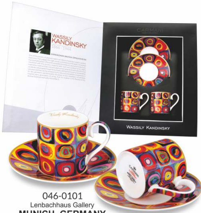
046-0101 Lenbachhaus Gallery MUNICH, GERMANY COLOR STUDY / 1913 SQUARES WITH CONCENTRIC CIRCLES