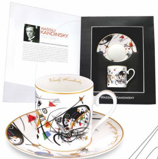
046-0304 Museum Kunstsammlung Nordrhein-Westfalen DÜSSELDORF, GERMANY TRANSVERSE LINE / 1923