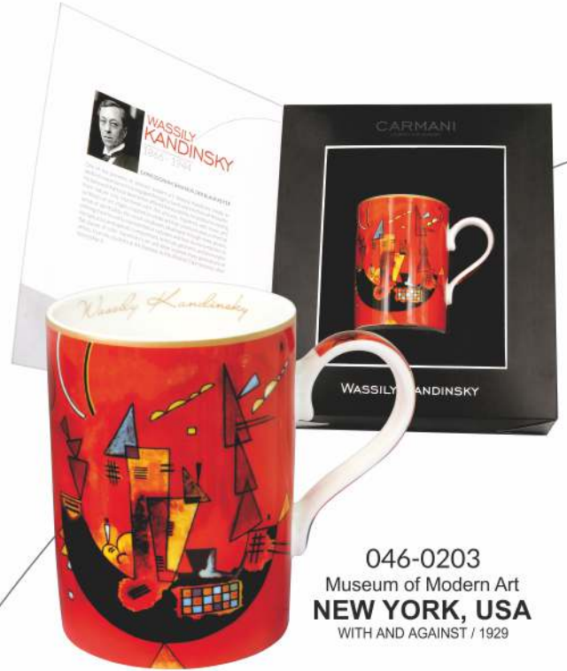
046-0203 Museum of Modern Art NEW YORK, USA WITH AND AGAINST / 1929