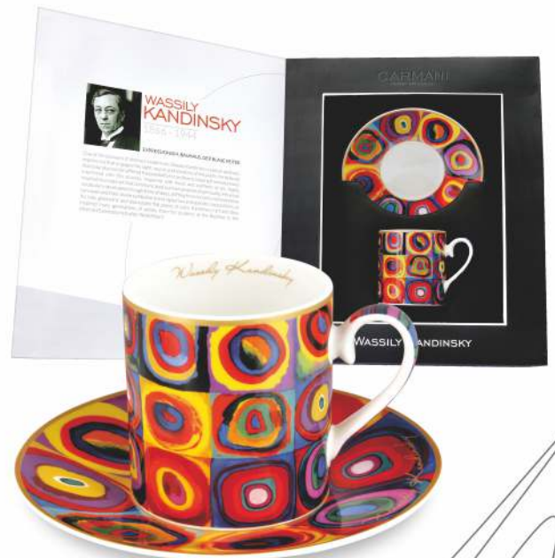
046-0301 Lenbachhaus Gallery MUNICH, GERMANY COLOR STUDY / 1913 SQUARES WITH CONCENTRIC CIRCLES